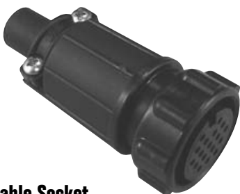
Cable Socket 13X8X-XXSG-XXX Matching Mates: • Cable-Cable 15X8X-XXPG-XXX • Panel 14XXX-XXPG-XXX